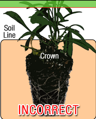
Do NOT bury the crown of the plug