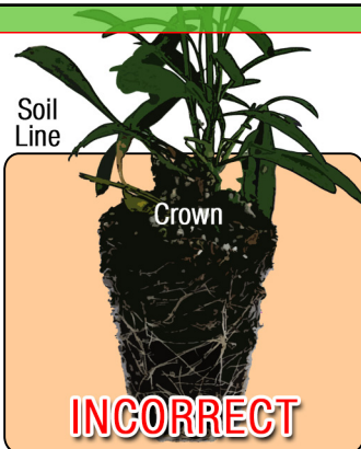
Do NOT bury the crown of the plug